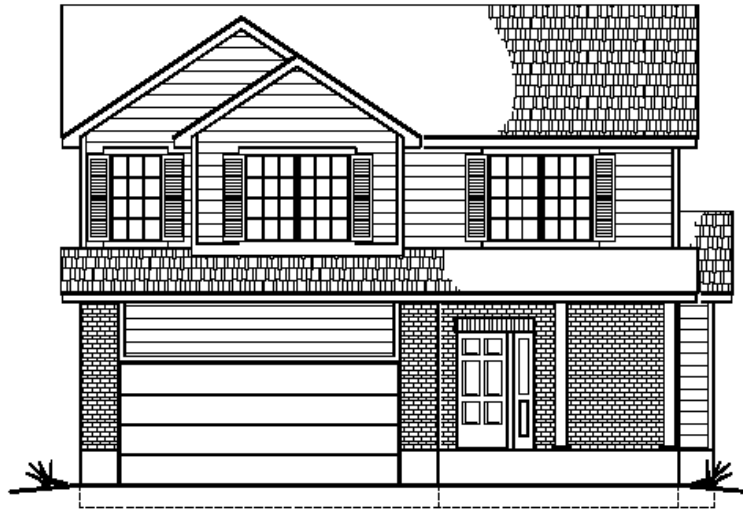
FRONT ELEVATION "B"