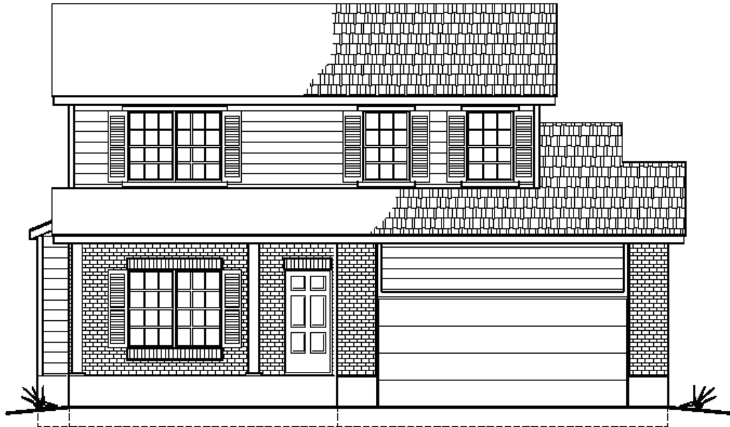
FRONT ELEVATION "B"