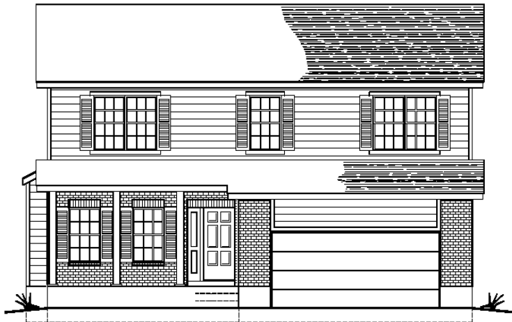
FRONT ELEVATION "B"