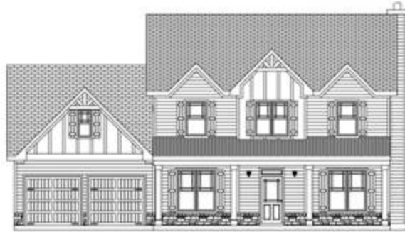
HANSEN @ SOUTHWEST PLANTATION CRAFTSMAN ELEV.-A